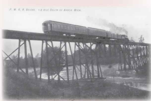
Above: A postcard from around 1900 shows a passenger train crossing the Mill Creek Trestle.

The Port Huron and Northwestern Railroad Company opened the narrow gauge railroad from Port Huron to East Saginaw in 1882. In 1889, the railroad was sold to the Pere Marquette Railroad and the tracks were changed to standard gauge. The St. Clair County Parks and Recreation Commission purchased the right of way from the CSX Railroad in 1999.