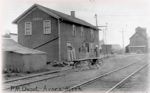
Above: An undated postcard shows the Avoca Depot, looking northwest. The Avoca grain elevator, which still stands today, can be seen in the background.